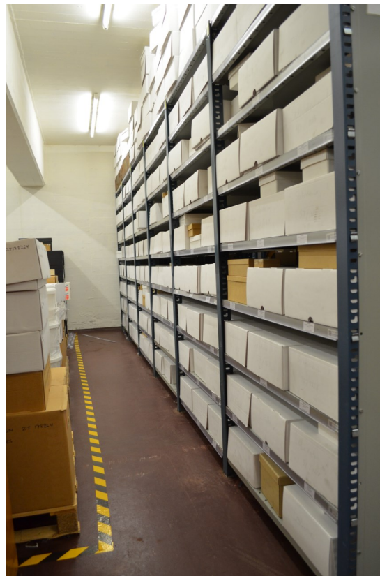
Fig. 8. Storage facility at the Natural History Museum of Denmark showing parts of the V. Lausen Collection.

The fossil collection consists of more than 100,000 fossil bones distributed in 14,000 lots, as well as more than 2,000,000 small bones from owl regurgitation pellets and around 1,300 breccia samples. Lund also sent many other samples to Denmark, including the skins of birds, various small animals in alcohol in