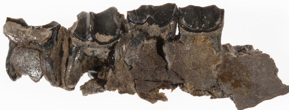
Fig. 4. Scalabrinitherium rothii Ameghino, 1882, Z.M.K. 116/1887, buccal view