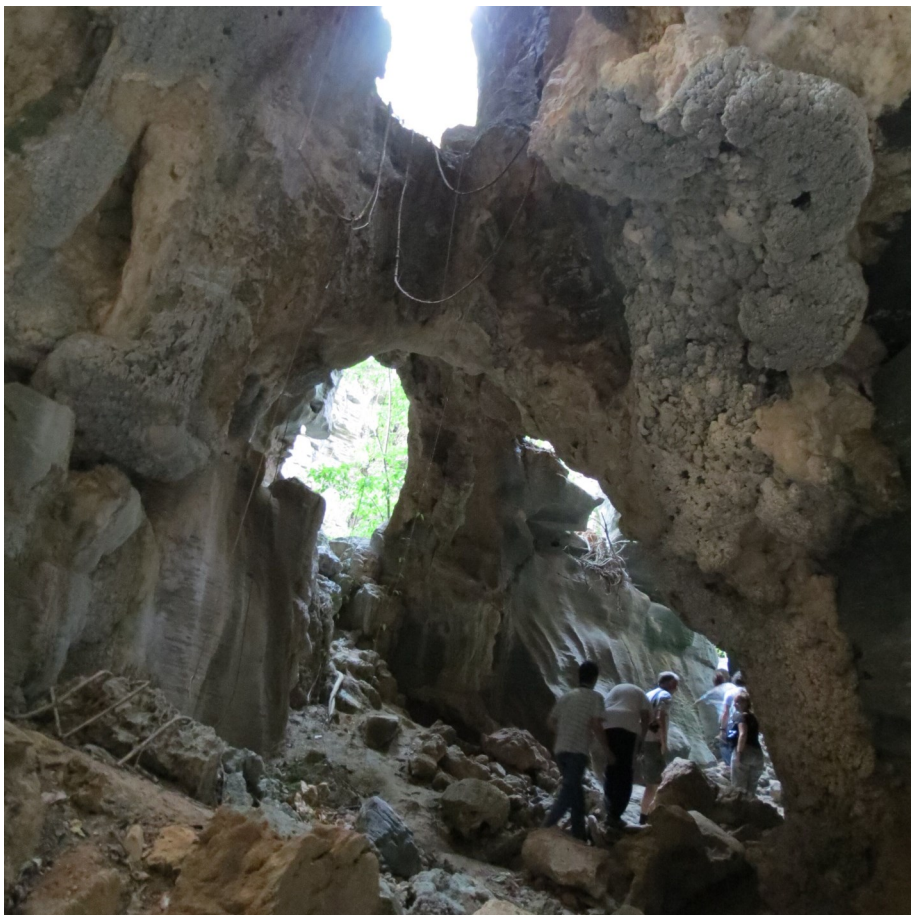
Fig. 10. The limestone cave Lapa da Cerca Grande, Brazil.

What Lund discovered and later described, was a fossil fauna primarily consisting of vertebrates, but also including a few invertebrates. The vertebrates had ended up in the caves in different ways. Some had been dragged in by carnivores, some had fallen through a crack in the roof of the cave and others, probably the majority (Eisenberg & Redford, 1999), had drifted in with the current of a stream or the rise of local water level during the rainy season. There is also evidence of Homo sapiens being buried in the caves (Piló et al. , 2005). The invertebrates had probably entered the caves via waterways.