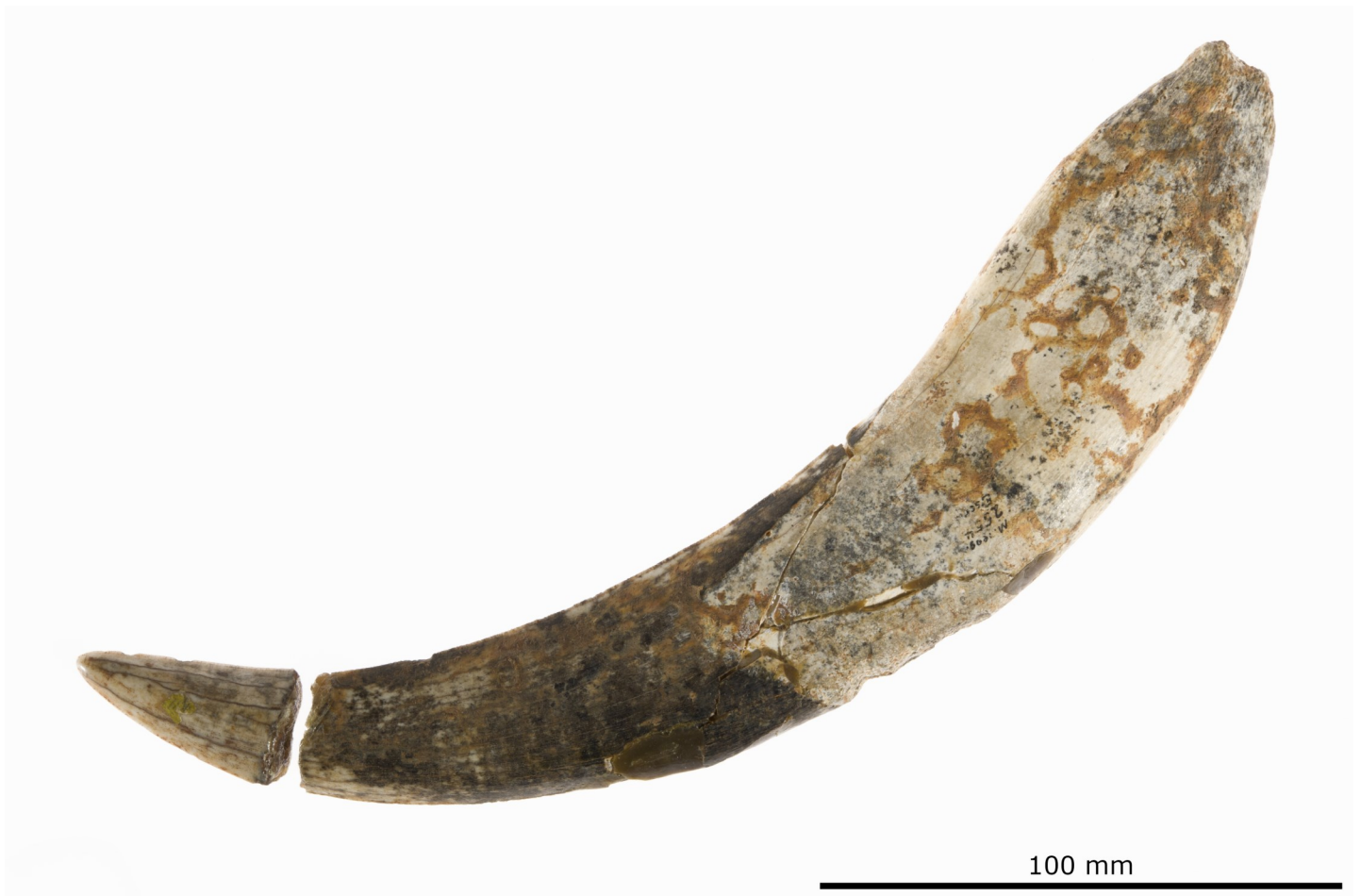
Fig. 12. Smilodon populator Lund, 1842, (Z.M.K. 1/1845:2554) canine tooth from upper jaw, one of several type specimens

of the type species are from Rodentia. The South American members of this order are currently under a massive process of revision, which has already impacted on the status and total number of Lund's type specimens and this trend is likely to continue in the years to come.