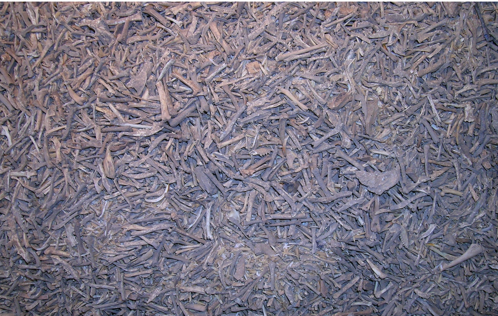
Fig. 11. Owl regurgitation sample.

The P.W. Lund Collection currently holds 47 type species ( Fig. 12 ) of which at least 25 have retained Lund's authorship. All of these are mammals except for one species of bird ( Chenalopex pugil Winge, 1887). More than half