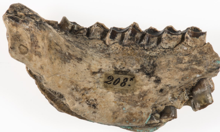
Fig. 3. Protypotherium antiquum Ameghino, 1882, Z.M.K. 21/1887, lingual view

The V. Lausen Collection includes three rediscovered type specimens: a piece of the right mandible of the rodent-like notoungulate Protypotherium antiquum Ameghino, 1882 (Fig. 3) and the left maxilla of the litoptern Scalabrinitherium rothii Ameghino, 1882 (Fig. 4), both of Miocene age (9.0 – 6.8 million years BP). Neoprocavia mesopotamica Ameghino, 1889 (Fig. 5), related to the capybara and of Miocene-Pliocene age, is under revision (Moreira et al. , 2012). This species is represented by a piece of the left mandible.