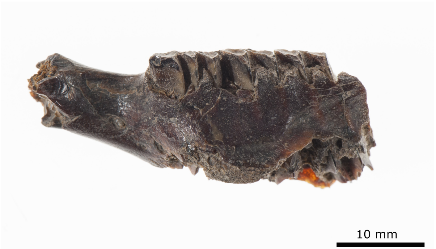
Fig. 5. Neoprocavia mesopotamica Ameghino, 1889, Z.M.K. 111/1887, buccal view