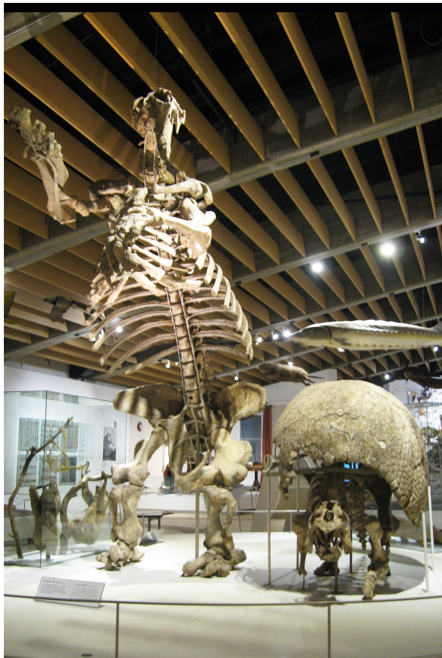
Fig. 2. Edentates from the V. Lausen Collection on exhibit at the Natural History Museum of Denmark, The Evolution Exhibit 2018.

terial in the V. Lausen Collection, the majority of the bones are intact or almost intact. Approximately 10-15% have fallen apart into smaller fragments or almost completely turned into a coarse-textured powder. Several individual skeletons are nearly complete and intact (Fig. 2).