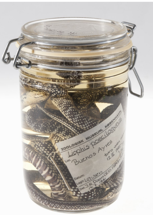
Fig. 6. Liophis poecilogyrus ( Erythrolamprus poecilogyrus (Wied-Neuwied, 1825)) a small and common colubrid snake.

reptiles and amphibians were probably caught by himself in and around the vicinity of Buenos Aires (Fig. 6). Around 10 species were received in alcohol through different couriers.