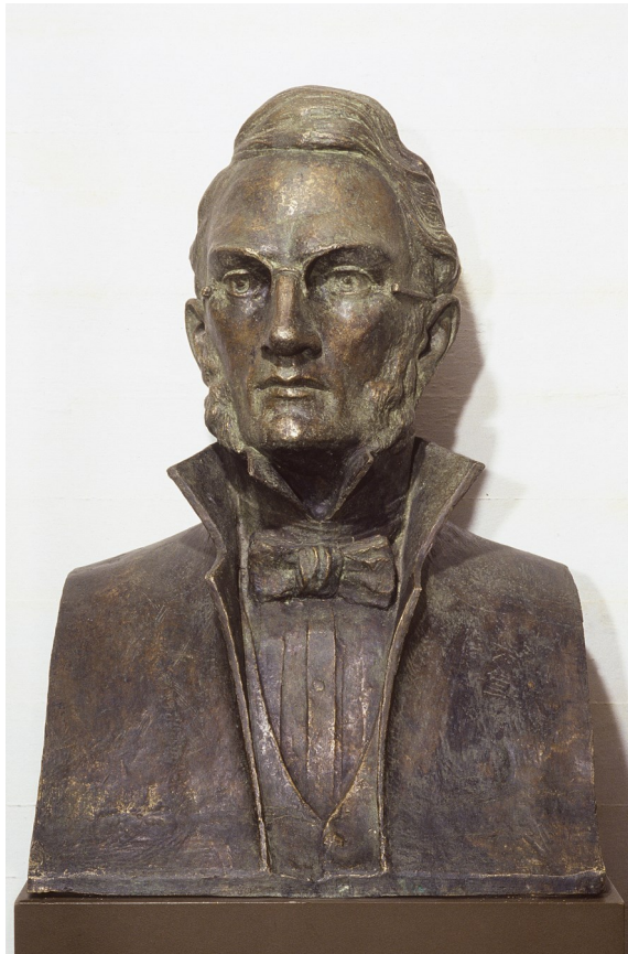
Fig. 9. P.W. Lund (Natural History Museum of Denmark).

glass containers, invertebrates, plants and even some ethnographical items. However, when the Lund Collection is referred to today, it is normal practice to only include the fossil material, which is kept together as one large unit in the storage facility. The subfossil specimens were collected by Lund himself (Fig. 9) in limestone caves near the town of Lagoa Santa in Minas Gerais, Brazil. The material was collected during the years 1834-1845. The material dates to the late Pleistocene and early Holocene age, and is similar to what has been found in large areas of Brazil (Eisenberg & Redford, 1999). C-14 dates taken from various mammal species yield dates of between 20,610 and 7580 YBP (calibrated age) (W. Neves, personal communication).