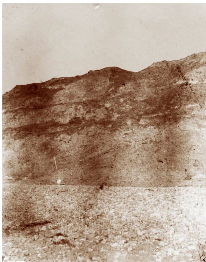
Fig. 4. Sketch by Arcade Noury showing the dinosaur site at Octeville in September, 1898.