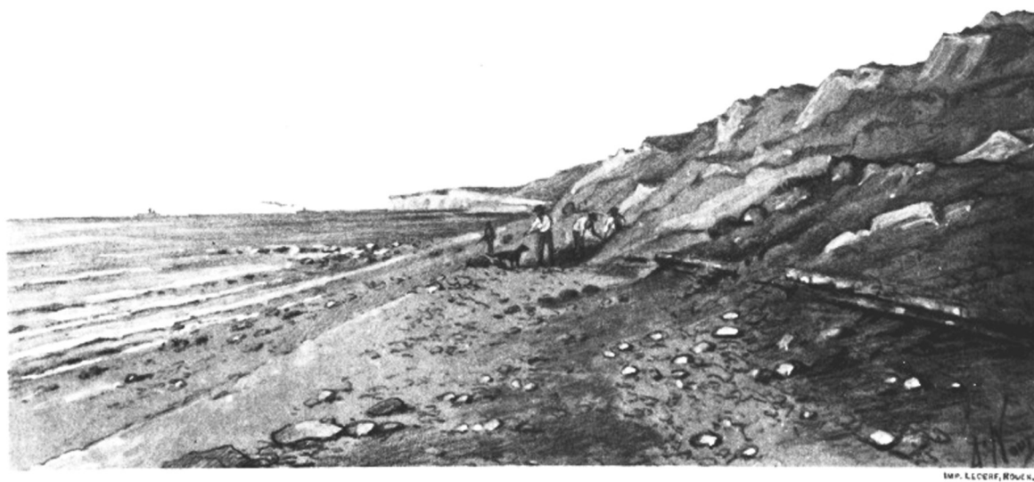
Fig. 3. Sketch by Arcade Noury showing the dinosaur site at Octeville in September, 1898.