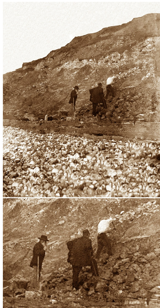
Fig. 5. Top: photograph n° 93 in Savalle's album, showing excavations at the Octeville dinosaur site. Bottom: close-up showing, from left to right, Arcade Noury, Gustave Lennier and "Père Mallet". after Lepage (2010b).